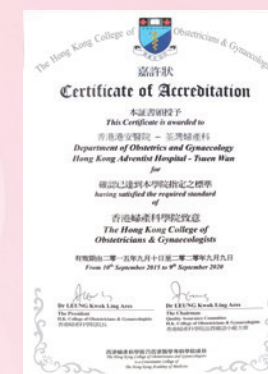
Hong Kong College of Obstetricians and Gynaecologists 香港婦產科學院